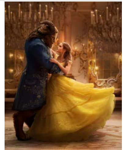
Emma Watson and Dan Stevens

What has made the film such a hit, is that people who saw the film years ago, are now parents. These parents want to share the magic they felt then, with their children now.