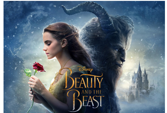
Film poster Beauty and the Beast

‘Beauty and the Beast’, the newest Disney film, is a hit. It is a remake of the 1991 classic. People who have seen it, both young and old, love it. The film has the same story, but is now a film with real people instead of cartoon figures.